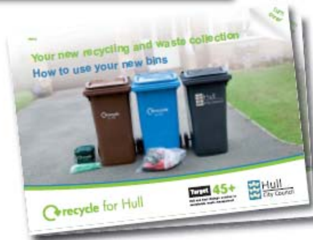
Instructional leaflet (cover and sample inside page)